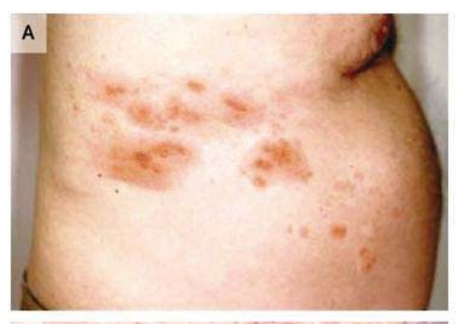
FIGURE 1. Thoracic distribution of zoster (A), and zoster rash with coalescing clusters of clear vesicles (B)

Zoster rash is typically unilateral and does not cross the mid-line, erupting in one or two adjacent dermatomes. The frequency of zoster occurrence in different dermatomes has been evaluated in certain studies. In general, thoracic, cervical, and ophthalmic involvement are most common (Figure 1) (26–28). Small numbers of lesions can occur outside the primary or adjacent dermatome. The rash is initially erythematous and maculopapular but progresses to form coalescing clusters of clear vesicles containing high concentrations of VZV (Figure 1). The vesicles form over several days and then evolve through pustular, ulcer, and crust stages. The rash usually lasts 7–10 days, with complete healing within 2-4 weeks. However, pigmentation changes and scarring might be permanent. Streptococcal