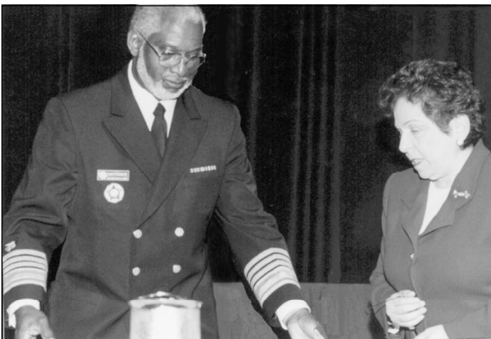
David Satcher, U.S. Surgeon General; Donna Shalala, U.S. Secretary of Health and Human Services.