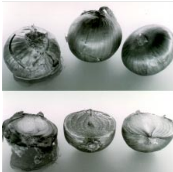
Figure 1. B. cepacia causes an onion rot known as slippery skin (1). The onions shown were inoculated with three strains of B. cepacia . Rot occurred in onion 1 (left), which was inoculated with strain originally isolated from onions. Rot did not occur with environmental isolates tested or with strains from CF lung.

Address for correspondence: Alison Holmes, Department of Infectious Diseases, Hammersmith Hospital, Du Cane Rd, London W12 0NN, United Kingdom; fax: 44-181-383-3394; e-mail: aholmes@rpms.ac.uk.